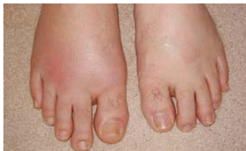
The injection appears effective in gout and may be steroid sparing

In one case, the patient has not had a flare for two months after being given a short course of anakinra. Another patient, however, has required anakinra